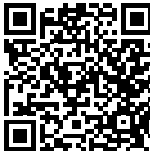
Model I Owner's Hub

Copyright © 2025, Brinkley RV. No part of this publication may be reproduced, distributed, or transmitted in any form or by any means, including photocopying, recording, or other electronic or mechanical methods, without the prior written permission of the publisher, except as permitted by U.S. copyright law.